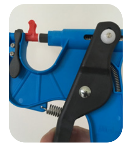
2c. Carefully squeeze the applicator handles until the large piston comes to a stop against the red connection piece