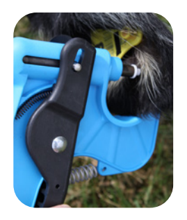
1b. Try to avoid large veins and ridges. The sample should be taken in a very swift, fluid motion.