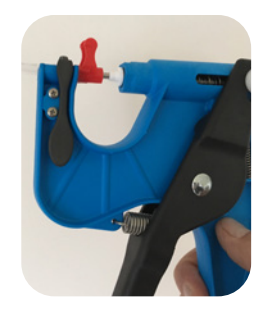
3. You have now completely seated the cutter. After the cutter is seated into the piston you can release the handles