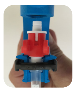
2b. After insertion of the TSU release the spring loaded clips to lock in the vial