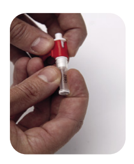
1. Take an assembled TSU (cutter + connection piece + collection vial)