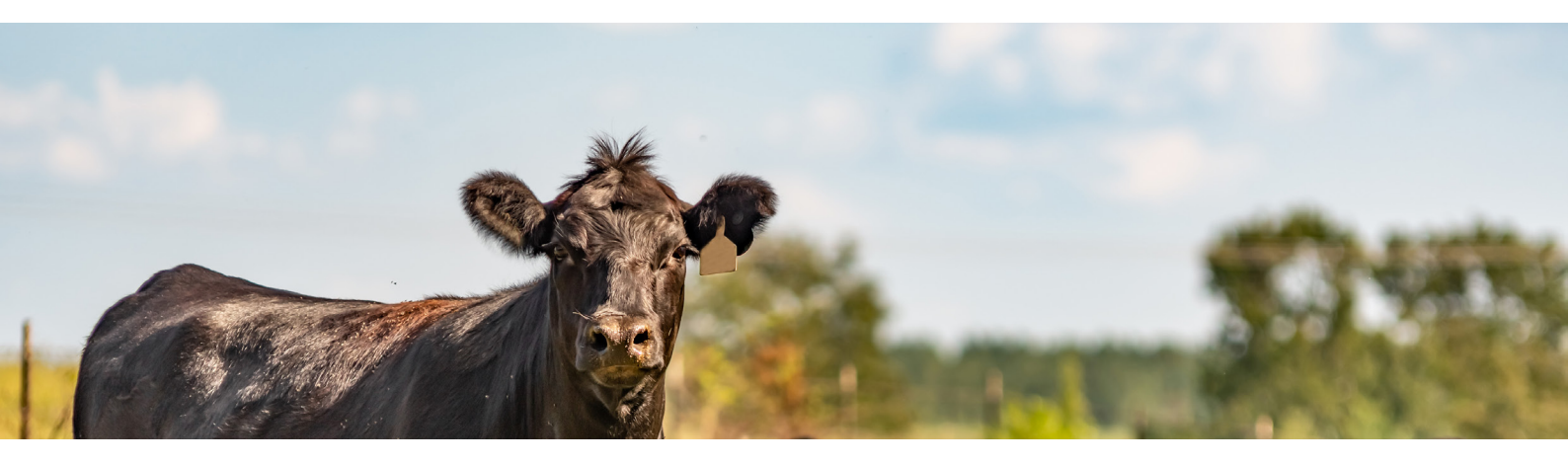
TSU vials should be stored at room temperature prior to use (for a maximum period of 12 months). Care should be taken not to expose the unused product to extremes of heat or cold prior to sampling.