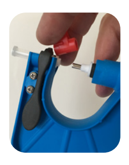
4. You can now easily remove the red connection piece while holding the two red tabs and pushing sideways