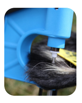
1a. Slide the loaded applicator over the ear and position the cutter about 1cm to 2cm from the edge of the ear.