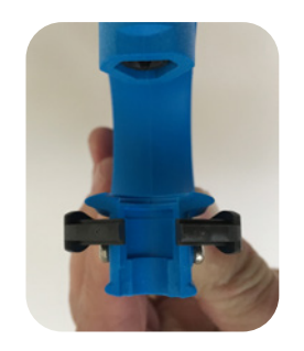
2. Squeeze the two spring loaded retainer clips together