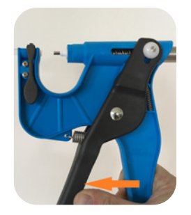
3. Remove the used cutter from the applicator by pushing the handles apart. This will loosen the cutter and make it easy to remove. You cannot reuse the cutter as it has no red plunger.