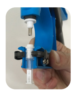
2a. Remove the TSU vial from the applicator by squeezing the two spring loaded clips together, then slide out the tube.